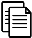
Customer facing documents